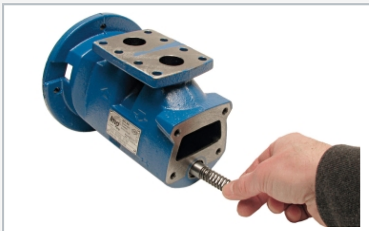
Assembly of the screw pump: assembling the valve piston with the valve spring