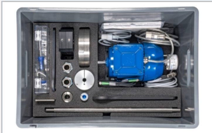
The illustration shows the components in the storage system