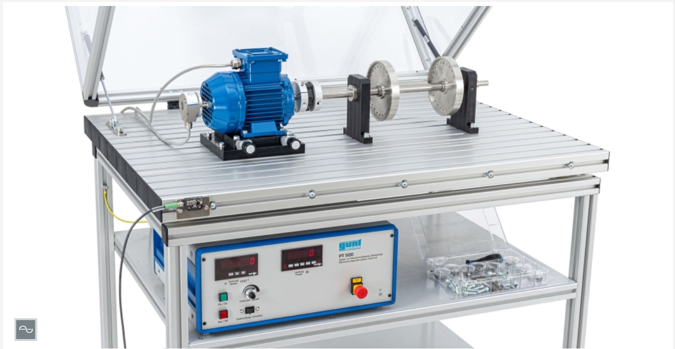
The illustration shows PT 500 together with the trolley PT 500.01