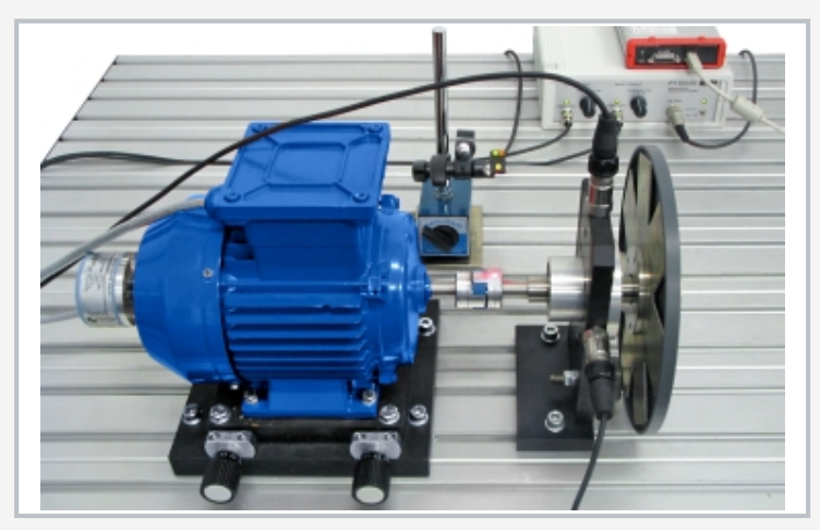
The illustration shows PT 500.18 together with PT 500 and PT 500.04 \,