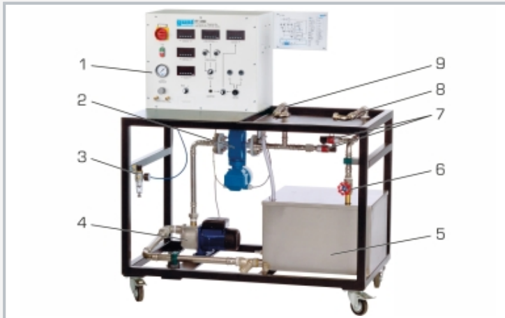
1 switch cabinet with controls, 2 flow rate sensor, 3 pressure reducing valve for air connection, 4 pump, 5 tank, 6 adjustment of flow rate, 7 pressure sensor, 8 outlet control valve, 9 inlet control valve