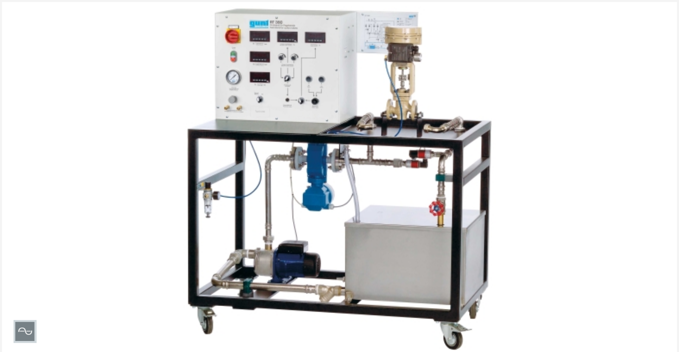
The illustration shows a similar unit with accessory RT 390.01.