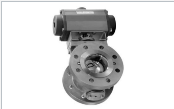
Segmented ball valve with single-action pneumatic swivel drive