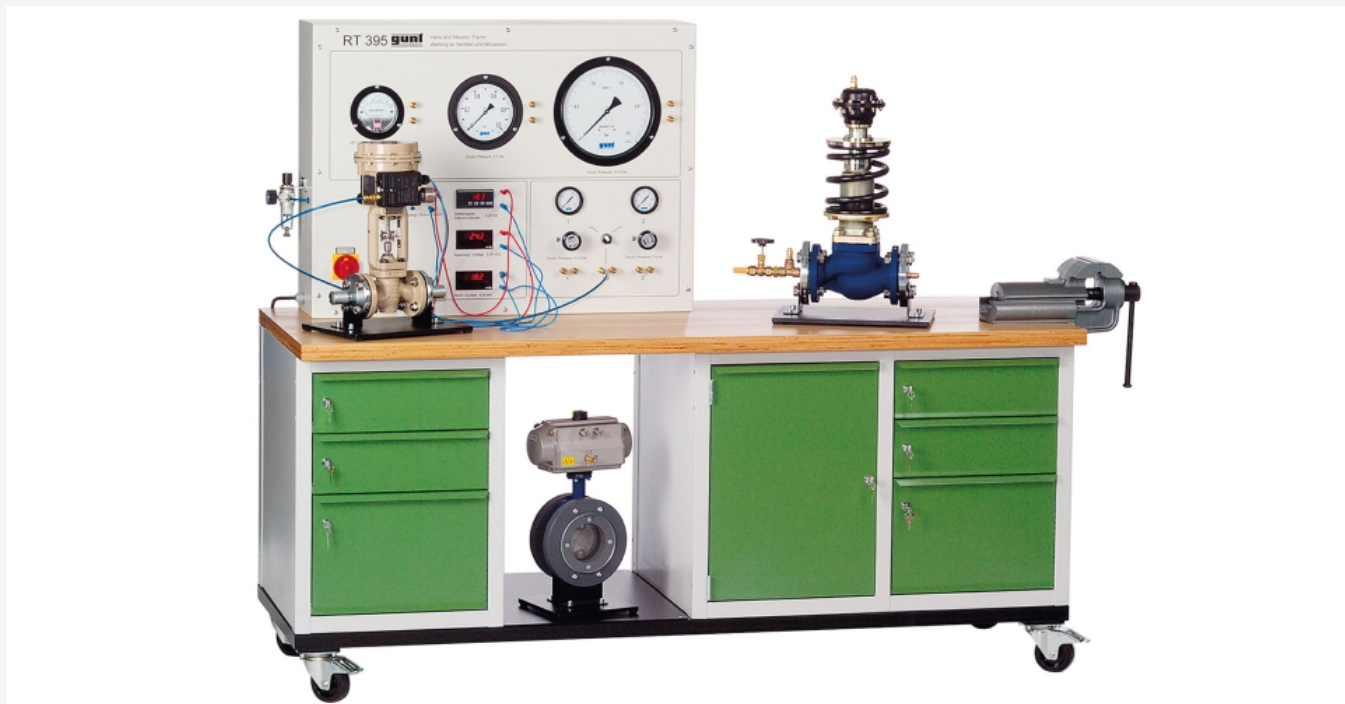
The illustration shows RT 395 with 3 of 4 fittings (segmented ball valve not shown).