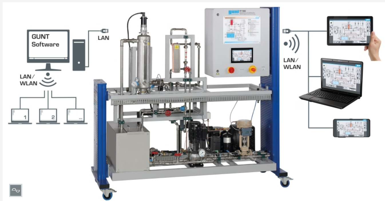
screen mirroring is possible on different end devices