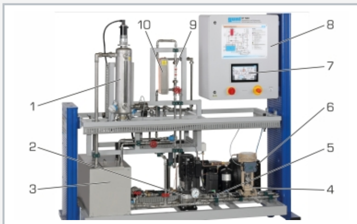
1 stirred tank with heater, 2 main circuit pump, 3 collecting tank, 4 control valve, 5 flow rate sensor, 6 refrigeration system, 7 touch screen, 8 switch cabinet, 9 flow meter, 10 heat exchanger