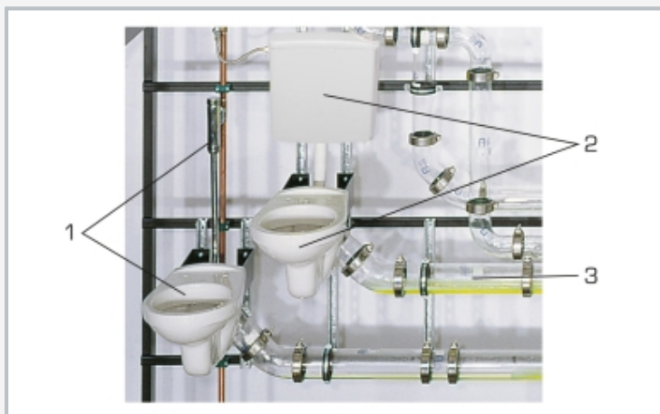
1 toilet bowl pressure flush, 2 toilet bowl with cistern, 3 transparent pipes