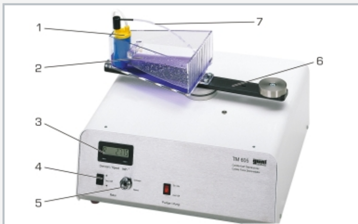
1 pump, 2 water tank, 3 speed display, 4 switch for direction of rotation, 5 speed adjustment, 6 rotating arm, 7 water jet