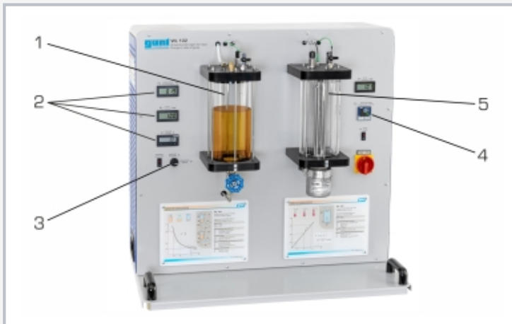
1 tank 1 for isothermic change of state, 2 digital displays, 3 switching between compression and expansion with 5/2-way valve, 4 heating controller, 5 tank 2 for isochoric change of state