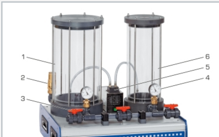
1 positive pressure tank, 2 safety valve, 3 ball valve, 4 manometer, 5 compressor, 6 negative pressure tank