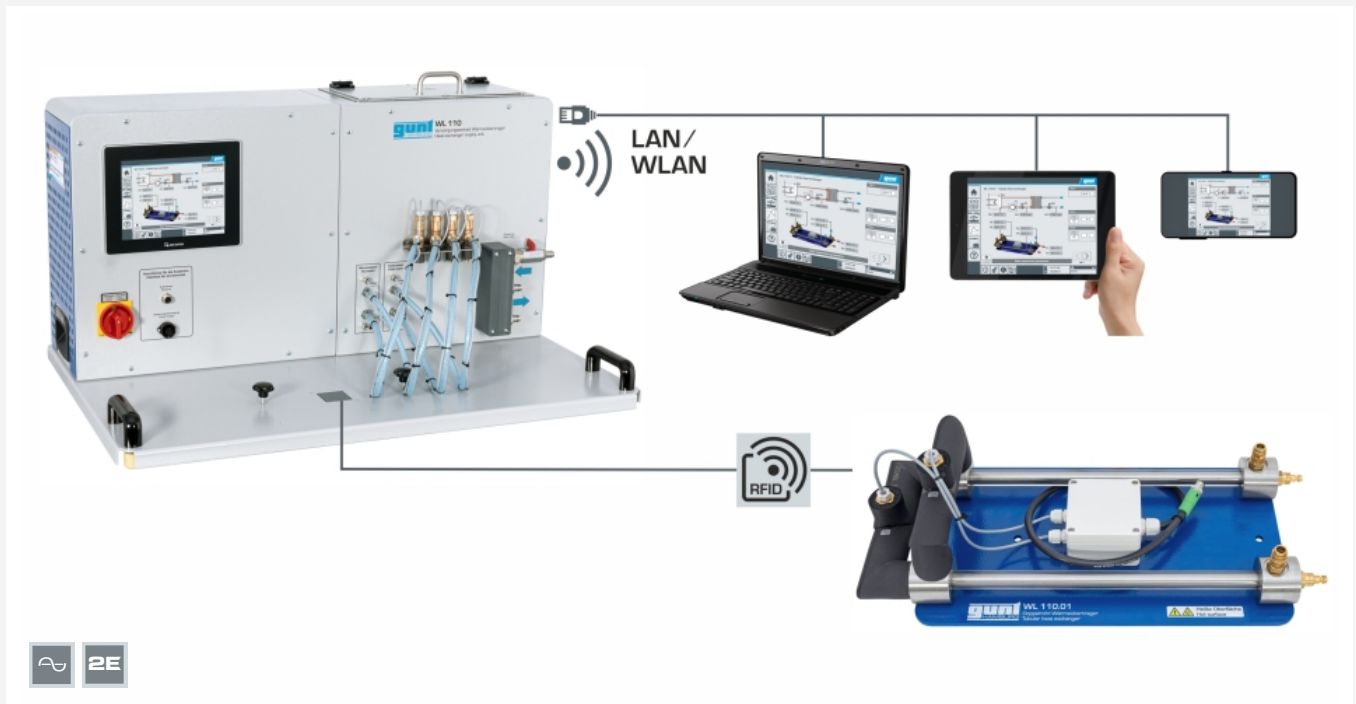
The illustration shows the WL 110 supply unit and the WL 110.01 accessory, screen mirroring is possible on up to 10 end devices