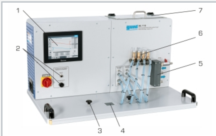
1 touchscreen of the PLC, 2 connections for heat exchanger sensors and power supply, 3 heat exchanger positioning, 4 RFID identification, 5 connections for cold water circuit, 6 water connections for heat exchanger, 7 water tank for hot water