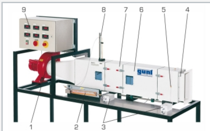
1 fan with throttle valve, 2 inclined tube manometer, 3 differential pressure sensor, 4 streamlined inlet, 5 pressure measurement via measuring nozzle, 6 air duct with windows, 7 measuring section for exchangeable accessories, 8 Pitot tube, 9 displays and controls