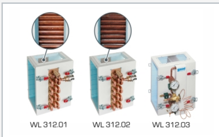
Accessories for the trainer: WL 312.01 Heat transfer with plain tubes WL 312.02 Heat transfer with finned tubes WL 312.03 Heat transfer on refrigerant evaporator