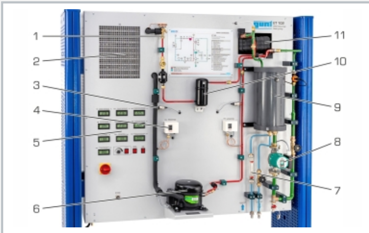
1 expansion valve, 2 evaporator with ventilator, 3 pressure sensor, 4 pressure switch, 5 displays and controls, 6 compressor, 7 cooling water flow meter, 8 pump, 9 hot water tank, 10 receiver, 11 cocondenser