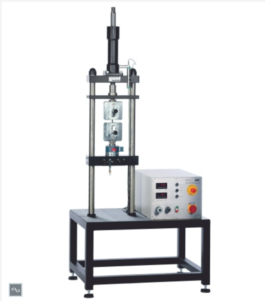
The illustration shows WP 310 together with the accessory WP 310.05.