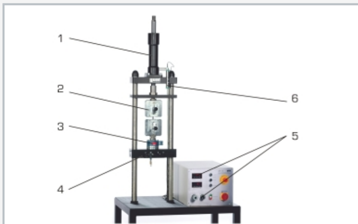
1 hydraulic cylinder for generating tensile and compressive forces, 2 operating area with the accessory WP 310.05, 3 force sensor, 4 adjustable height lower cross-member with lock, 5 displays and controls, 6 displacement sensor