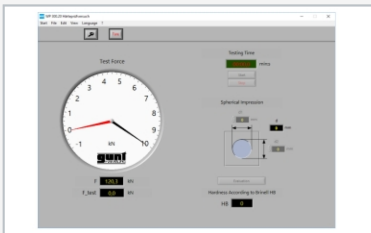
Software screenshot: Brinell hardness test