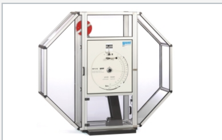
Protective cover for pendulum impact tester WP 410.50 available as an accessory