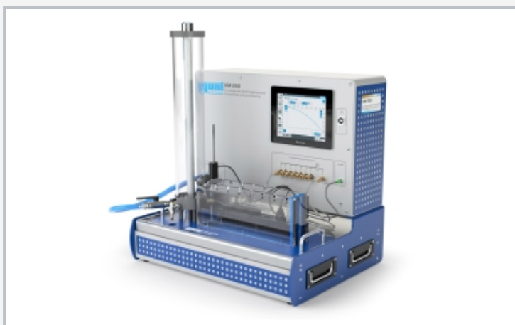
The illustration shows the HM 250.06 accessory on the worktop of the HM 250 base module