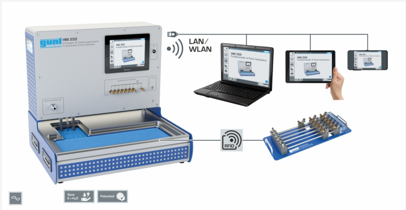
The illustration shows the HM 250 base module on the left and the HM 250.09 accessory on the right, screen mirroring is possible on up to 10 end devices