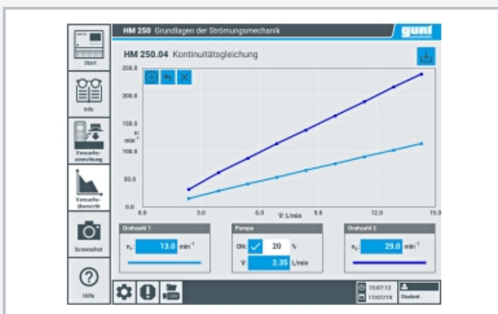
Intuitive user interface on the HM 250 touch screen: graphic display of the measured values, speeds of the two impellers in different cross-sectional flow areas of the pipe section