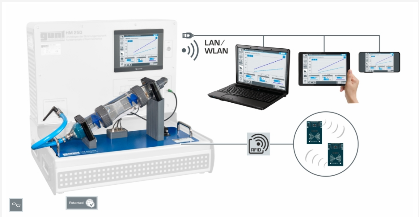
Complete experimental setup with the HM 250 base module, screen mirroring is possible on up to 10 end devices