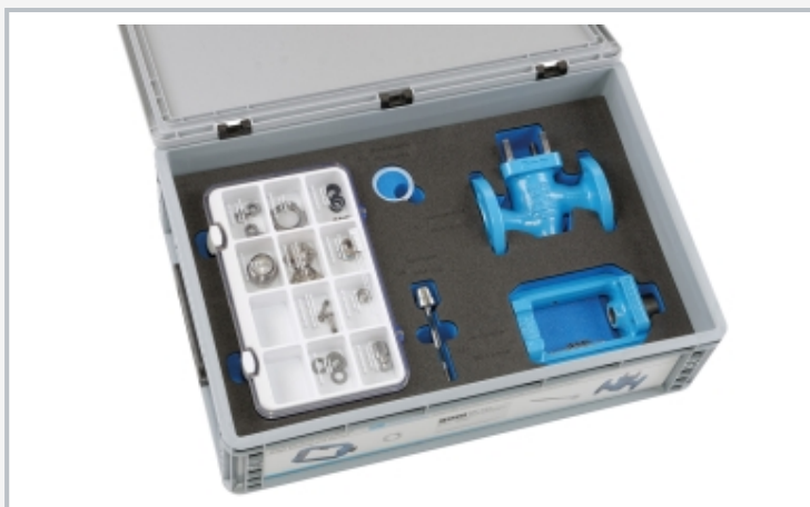
Storage system with foam inlay: all components have their place, the foam is labeled