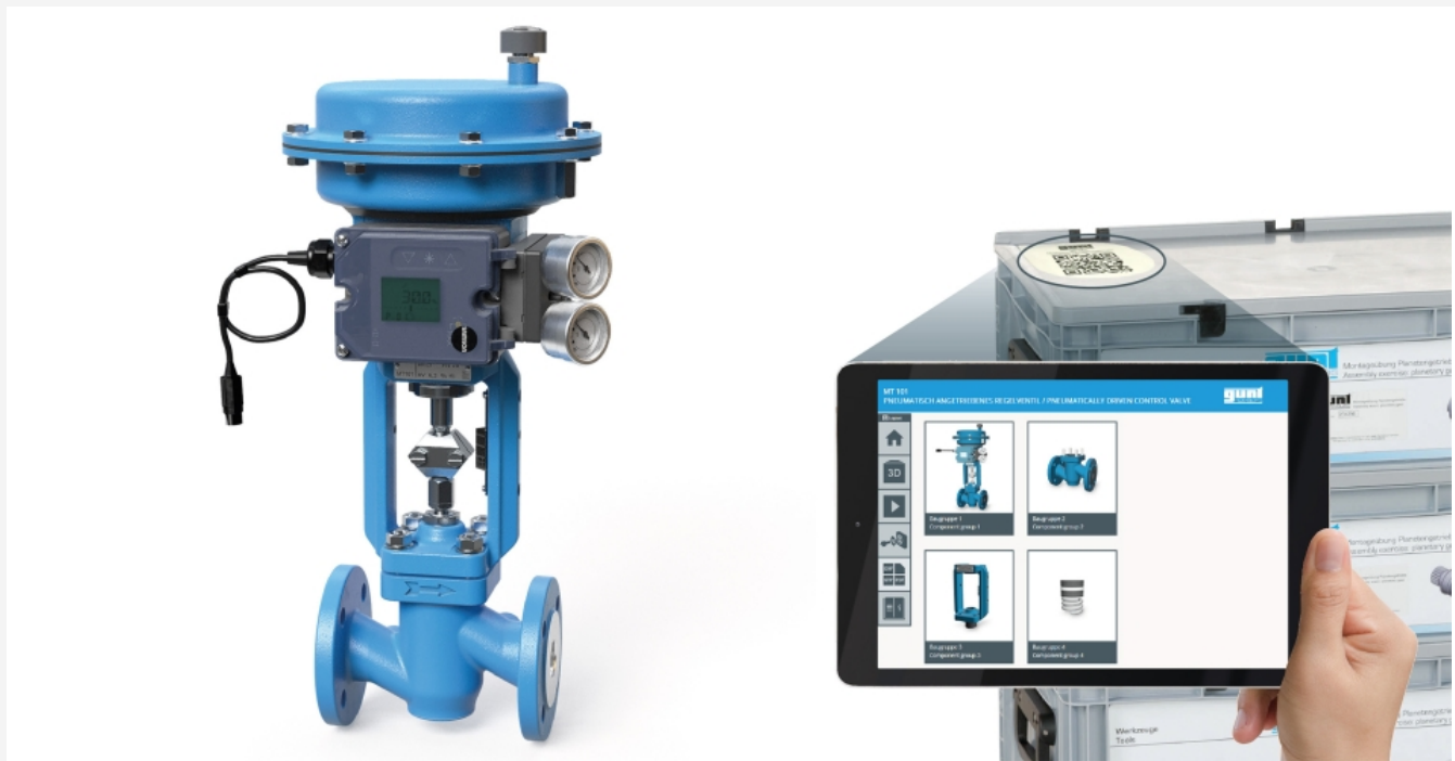
The illustration shows the assembled control valve and the GUNT Media Center on a tablet (not included)