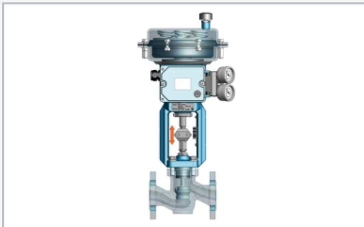
Transparent sectional view of the assembled gear (screenshot from assembly video)