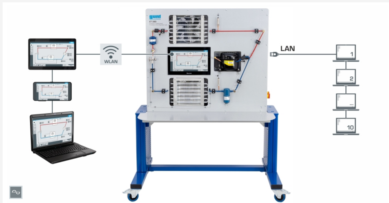
screen mirroring is possible on up to 10 end devices