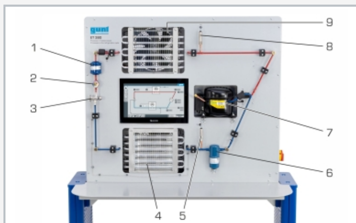
1 filter/dryer, 2 sight glass with moisture indicator, 3 thermostatic expansion valve (TEV), 4 evaporator with ventilator, 5 pressure sensor (low pressure), 6 liquid separator, 7 compressor, 8 pressure sensor (high pressure), 9 condenser with ventilator