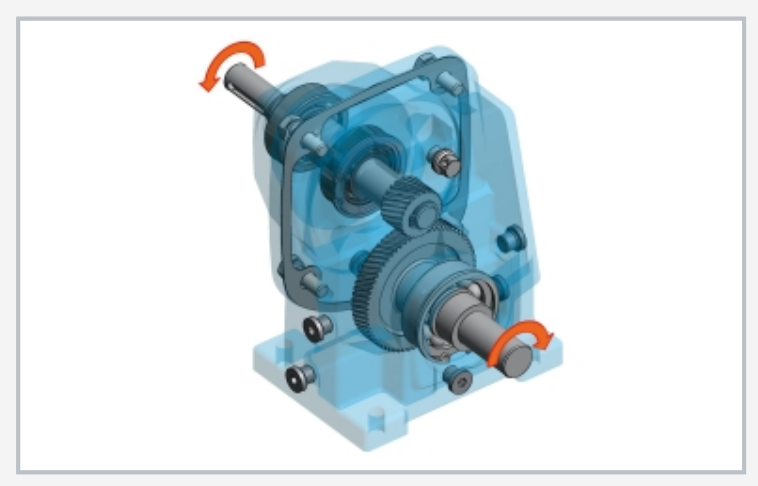
Transparent sectional view of the assembled gear