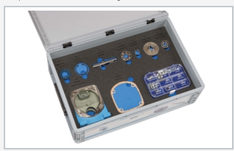
\ensuremath{\mathsf{MT}} 120: storage system with foam inlay, all components have their place, the foam is labeled