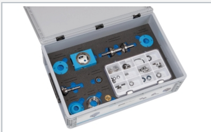
MT 121: storage system with foam inlay, all components have their place, the foam is labeled