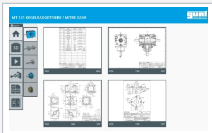
Screenshot of the GUNT Media Center