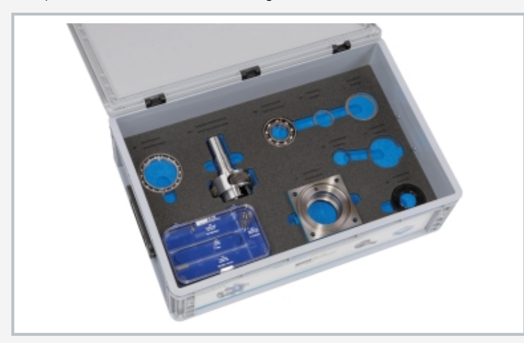
MT 122: storage system with foam inlay, all components have their place, the foam is labeled