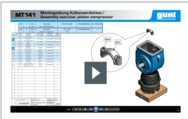
Multimedia teaching material: assembly video