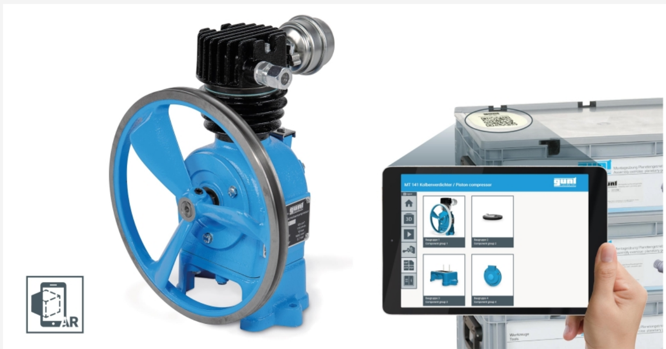
The illustration shows the assembled piston compressor and the GUNT Media Center (tablet not included)