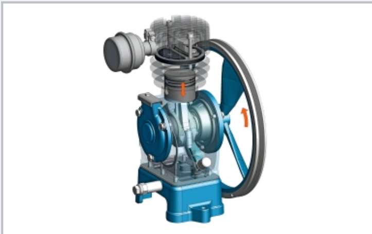
Transparent view of the assembled piston compressor (screenshot from assembly video)