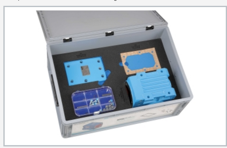
Storage system with foam inlay: all components have their place, the foam is labeled