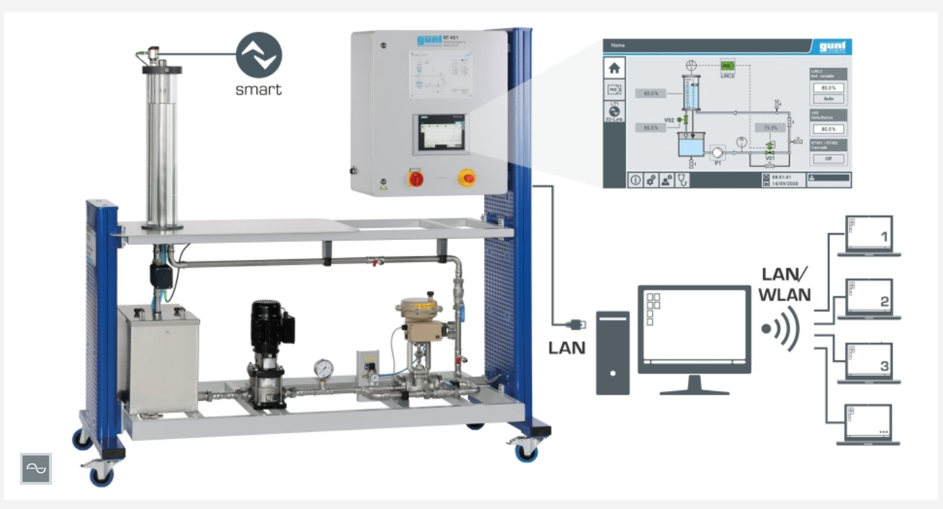
Control and operation via touch screen or a PC with GUNT software. Observation and analysis of the experiments at any number of workstations via LAN/WLAN.