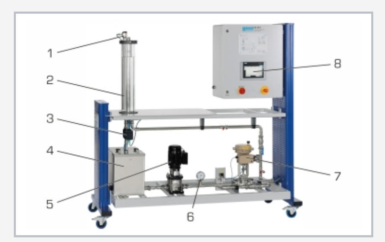
1 smart level sensor, 2 transparent tank, 3 proportional valve with motor drive, 4 storage tank, 5 pump, 6 manometer, 7 control valve, 8 touch screen