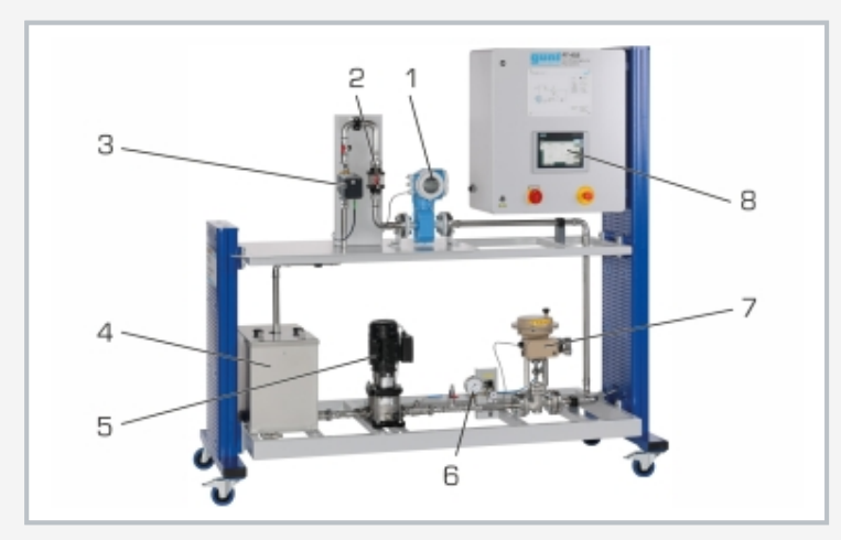
1 smart flow rate sensor, 2 flow rate indicator, 3 proportional valve with motor drive, 4 storage tank, 5 pump, 6 manometer, 7 control valve, 8 touch screen