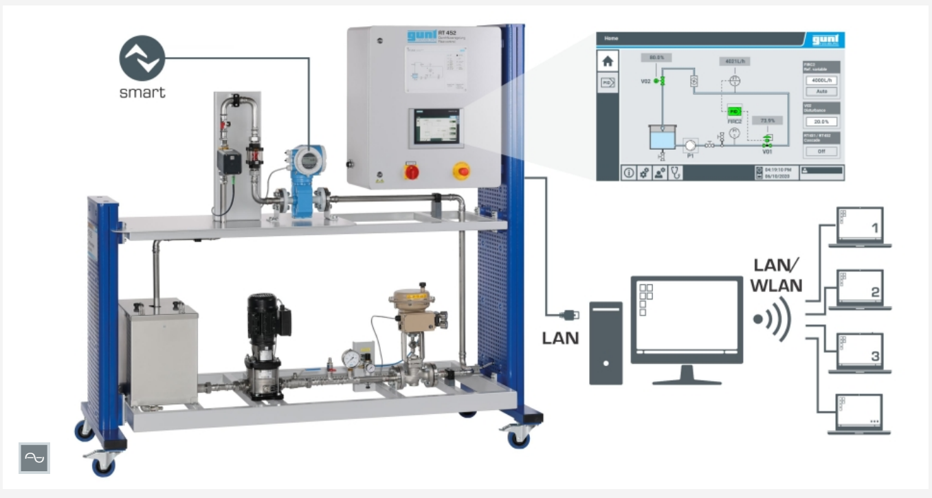
Control and operation via touch screen or a PC with GUNT software. Observation and analysis of the experiments at any number of workstations via LAN/WLAN.