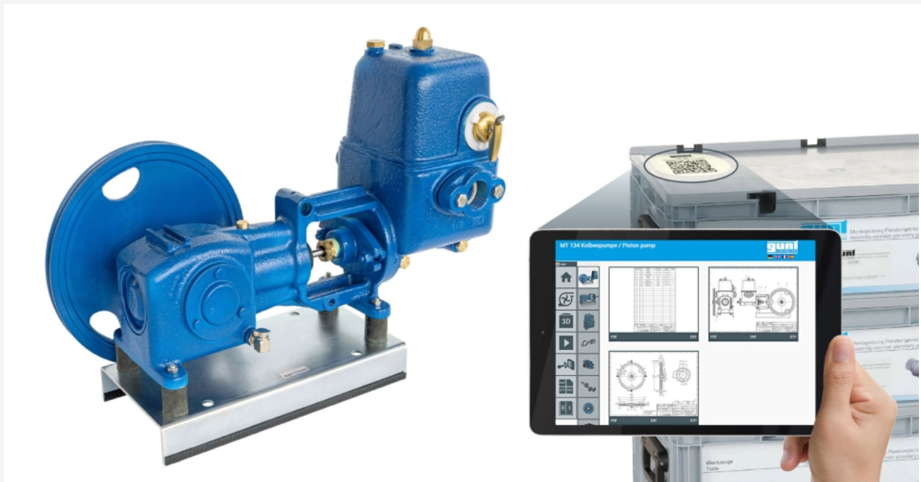
The illustration shows the device and the GUNT Media Center, tablet not included