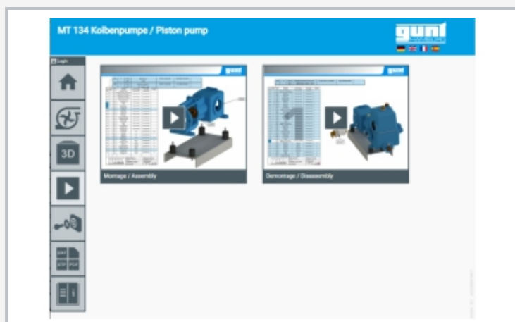
Screenshot of the GUNT Media Center