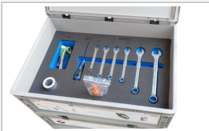
Storage system with foam inlay: tools