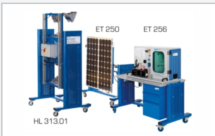
ET 256 together with the optional artificial light source HL 313.01 and solar modules ET 250