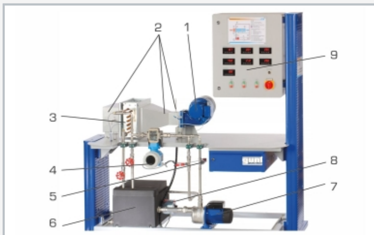
1 fan, 2 air duct with temperature measuring points, 3 heat exchanger, 4 flow meter, 5 pressure sensor, 6 water tank, 7 pump, 8 heater with thermostat, 9 displays and controls