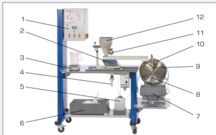
1 switch cabinet, 2 solid material metering device, 3 balance, 4 pressure reducing valve, 5 granulating liquid tank, 6 solids tank, 7 agglomerate tank, 8 dish granulator, 9 scraper, 10 two-component nozzle, 11 vibrator, 12 solids silo