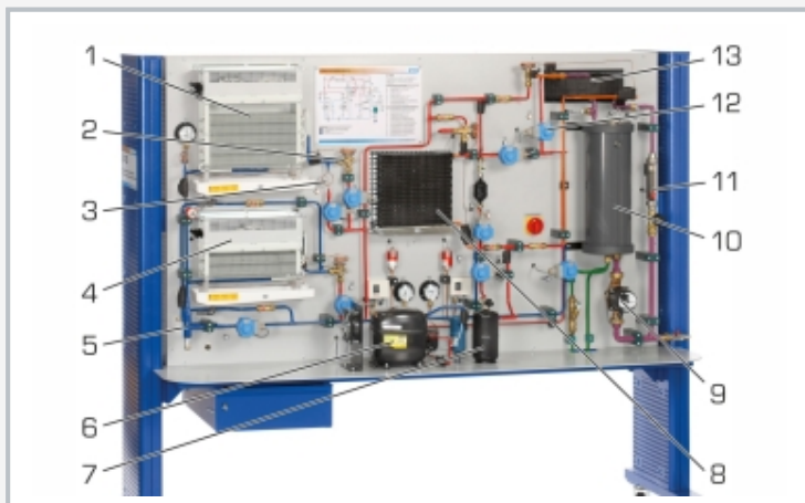
1 evaporator, 2 expansion valve, 3 capillary tube, 4 freezing stage evaporator, 5 evaporation pressure controller, 6 compressor, 7 receiver, 8 heat exchanger with fan, 9 pump, 10 tank for glycol-water mixture, 11 flow meter (glycol-water), 12 solenoid valve, 13 coaxial coil heat exchanger