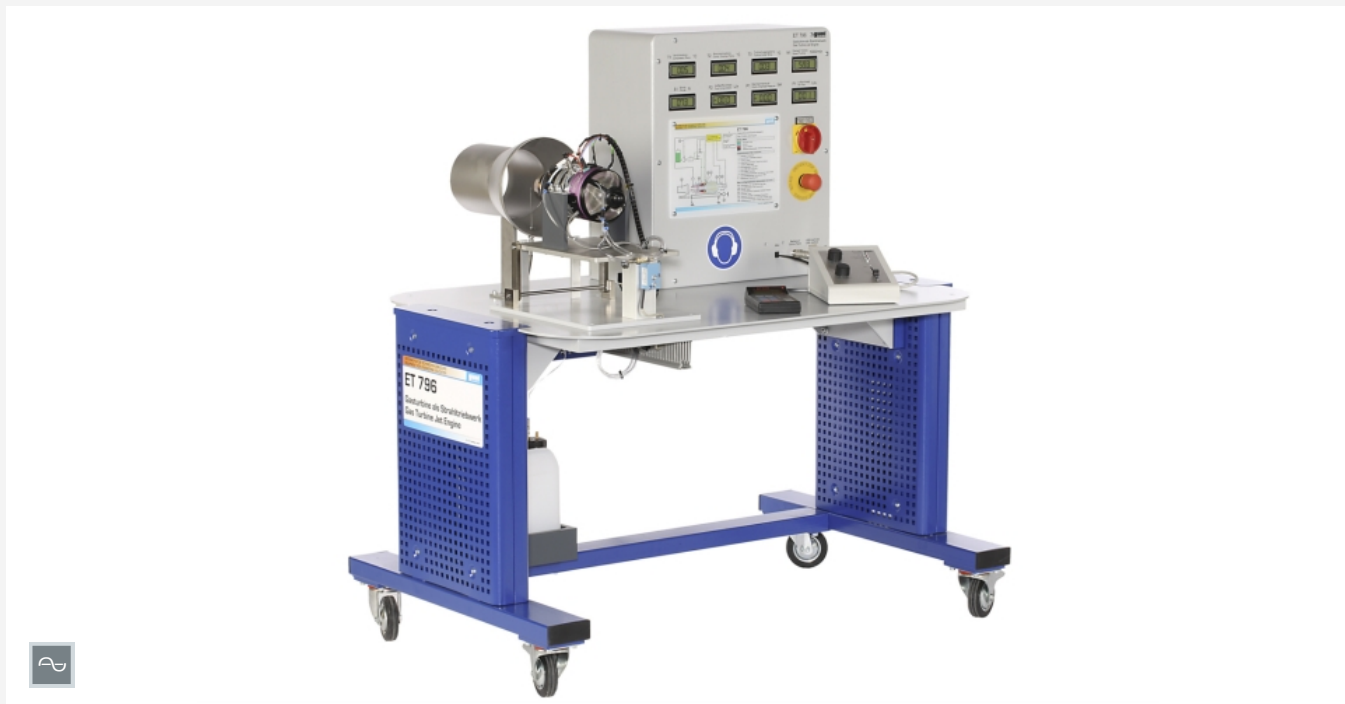
The illustration shows the jet engine without the protective grating