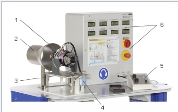
1 jet engine, 2 mixing pipe, 3 turbine platform, 4 force sensor for thrust measurement, 5 gas turbine controls, 6 displays and controls trainer