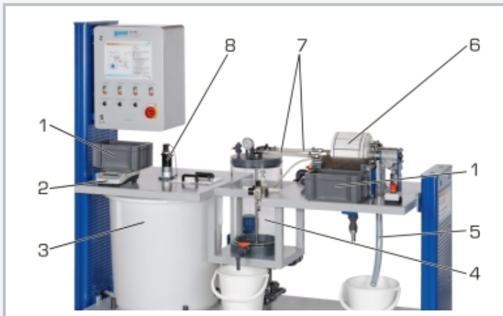
1 filter cake collector tank, 2 balance, 3 suspension storage tank, 4 filtrate vacuum tank, 5 overflow/outlet, 6 drum cell filter, 7 vacuum supply, 8 stirrer