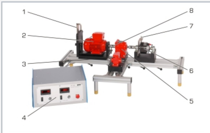
1 spring balance, 2 motor, 3 worm gear, 4 display and control unit, 5 spur gear, 6 brake, 7 brake lever arm, 8 coupling