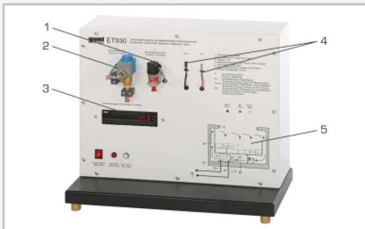
1 pressure sensor, 2 electronic expansion valve, 3 display of the refrigeration controller, 4 temperature sensor, 5 diagram of the simulated freezer