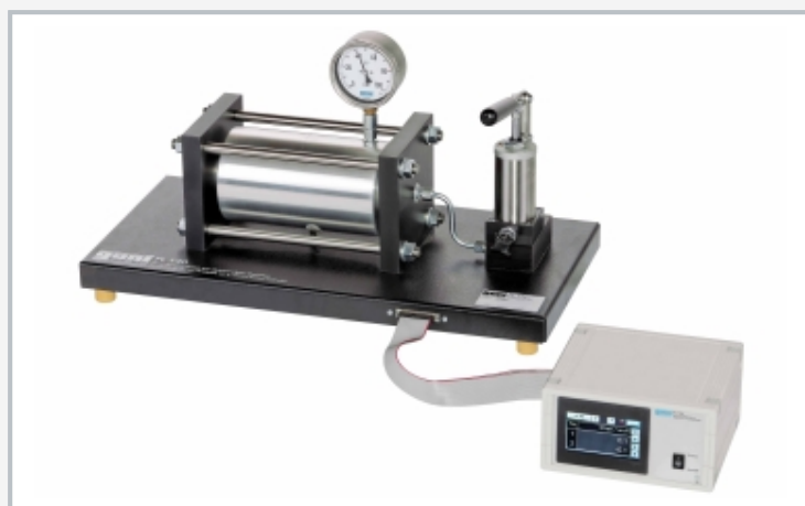
Example application: FL 152 in conjunction with FL 140 (stress and strain analysis on a thick-walled cylinder)