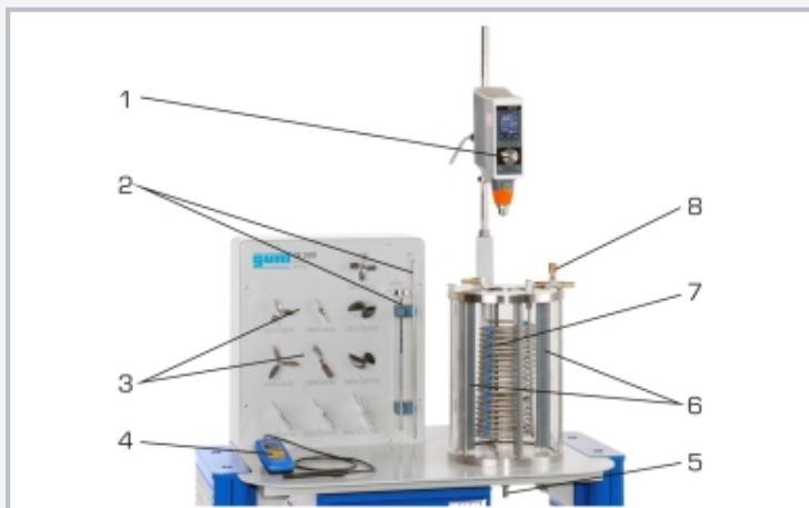
1 stirring machine with speed and torque indicator, 2 turbine stirrer and threaded shaft for stirring heads, 3 stirrer elements, 4 conductivity meter, 5 outlet, 6 flow impeder, 7 coiled tube, 8 shut-off valve for coiled tube