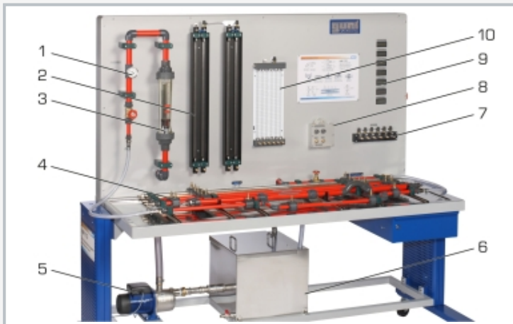
1 thermometer, 2 twin tube manometer, 3 rotameter, 4 different pipe sections, 5 pump, 6 storage tank, 7 pressure sensor, 8 differential pressure meter, 9 digital pressure indicators, 10 6 tube manometers