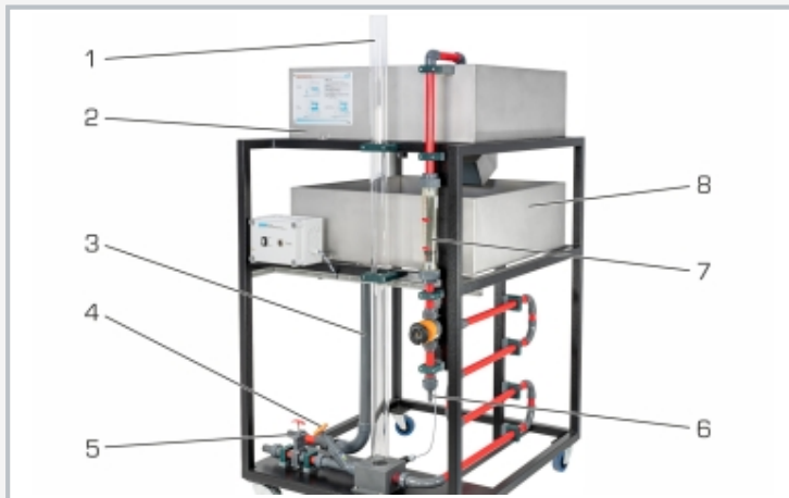
1 surge chamber, 2 basin A with adjustable weir, 3 overflow pipe, 4 valve in drain pipe, 5 gate for generating water hammer, 6 water connection, 7 flow meter, 8 basin B with overflow