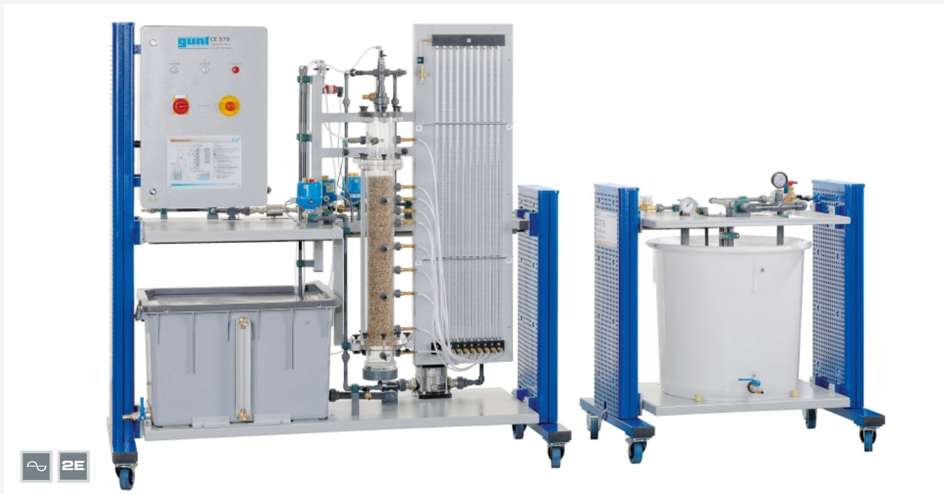
The illustration shows: trainer (left) and supply unit (right).