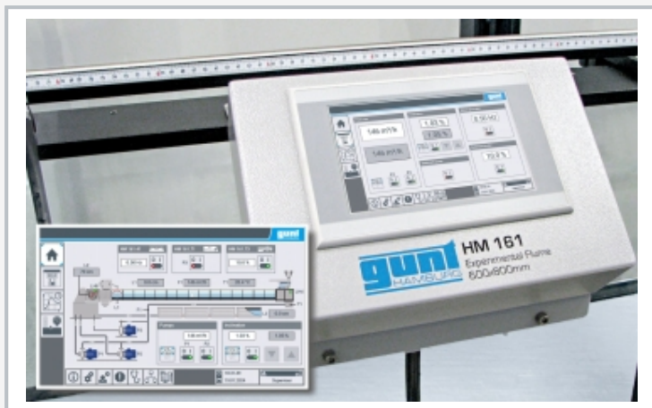
Touch panel freely positionable