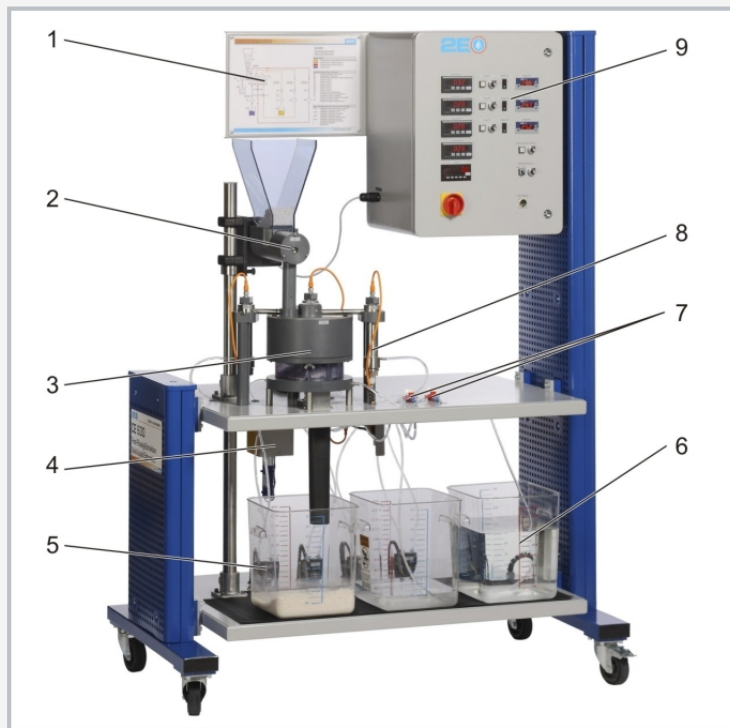
1 process schematic, 2 spiral conveyor for extraction material, 3 revolving extractor, 4 revolving extractor drive unit, 5 pump (behind the tanks), 6 tank, 7 mode selector valves, 8 heater and solvent feed, 9 switch cabinet with controls