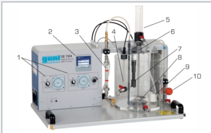
1 control elements for the compressor and for the stirring machine, 2 process controller, 3 flow meter (air), 4 pH value sensor, 5 metering device, 6 stirring machine, 7 oxygen sensor, 8 aeration device, 9 float for clear water extraction, 10 suction bulb for clear water