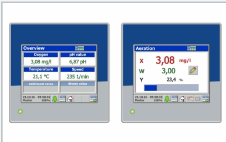
Digital process controller display of process variables (left), user interface for controlling oxygen concentration (right)