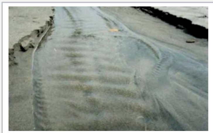
Erosion and scour formation in nature