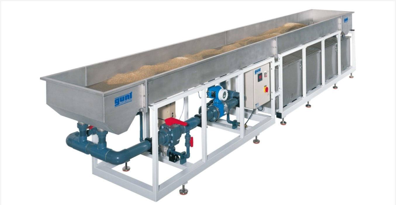
The illustration shows a similar unit