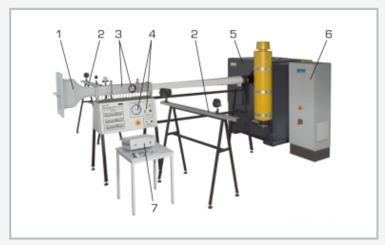
1 supersonic wind tunnel, air inlet, 2 Schlieren optics (two piece), 3 measuring section with two sight windows, 4 control panel with manometer, 5 fan, 6 switch cabinet, 7 data acquisition for pressure