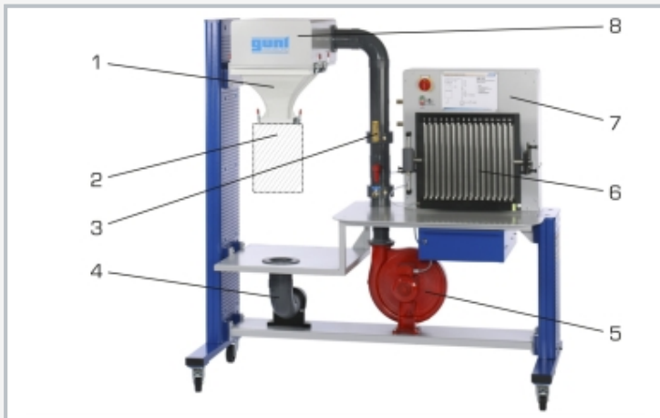
1 nozzle, 2 installation measuring section, 3 thermometer, 4 exhaust air pipe, 5 radial fan, 6 tube manometers, 7 switch cabinet with speed adjustment, 8 stabilisation tank with flow straightener