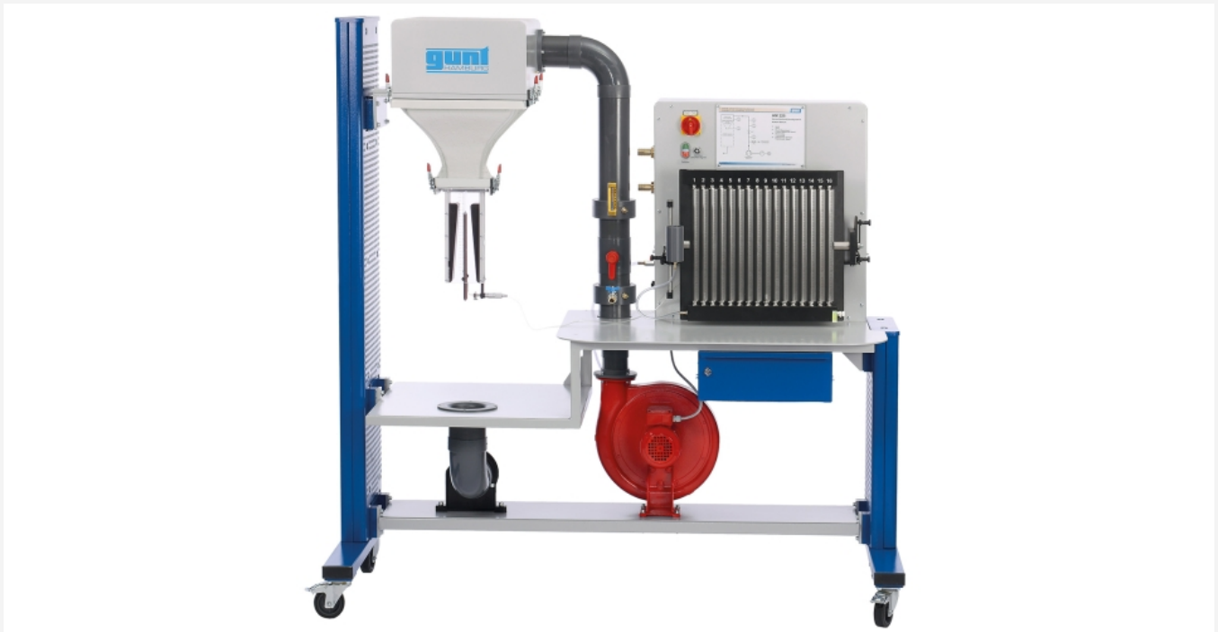
The illustration shows HM 225 together with HM 225.02.