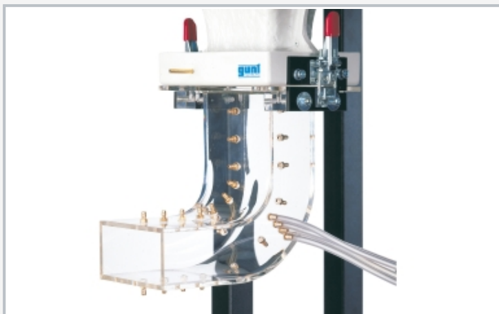
Investigation of flow in a pipe elbow with the accessory HM 225.05