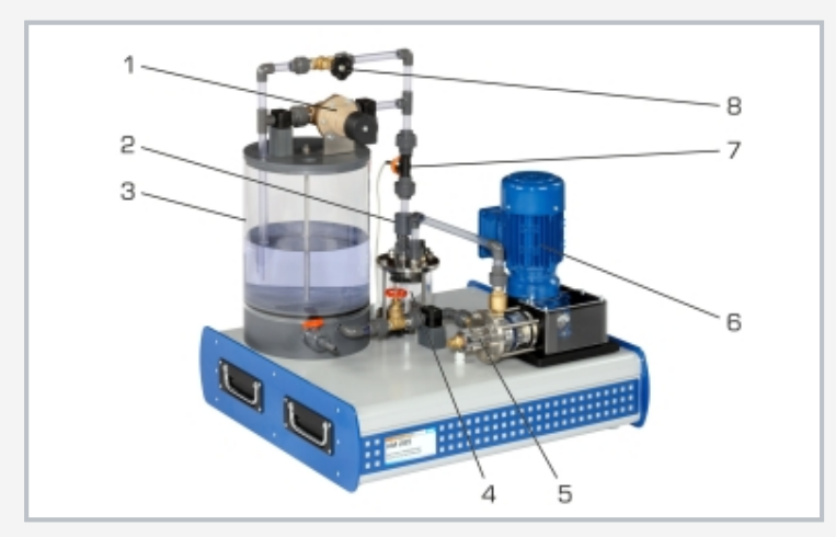
1 overflow valve, 2 pressure sensor at outlet, 3 water tank, 4 air vessel, 5 piston pump, 6 motor, 7 flow meter, 8 needle valve for adjusting the flow rate