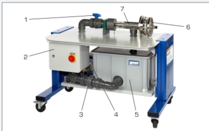
1 valve for adjusting the flow rate, 2 switch cabinet, 3 flow rate measurement with measuring orifice and differential pressure measurement, 4 pump, 5 tank, 6 eddy current brake, 7 axial turbine