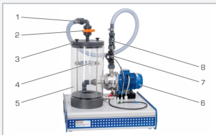
1 water connection, 2 throttle valve for pump experiments, 3 tank cover, 4 damping plate, 5 water tank, 6 pump with motor, 7 pressure sensor, 8 flow meter