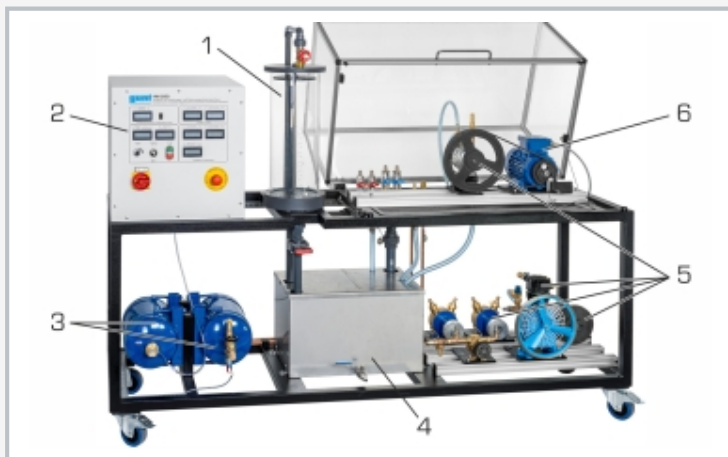
1 measuring tank, 2 displays and controls, 3 stabilisation and pressure vessel, 4 supply tank, 5 pumps and compressor, 6 drive motor